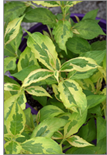
My Monet Sunset Weigela foliage

My Monet Sunset Weigela is recommended for the following landscape applications;