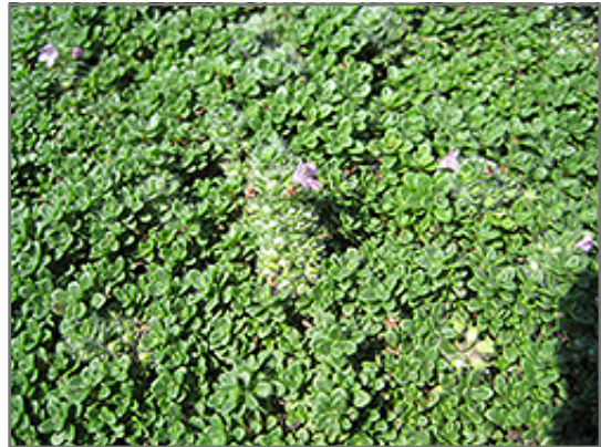
Elfin Creeping Thyme in bloom

This plant will require occasional maintenance and upkeep, and is best cleaned up in early spring before it resumes active growth for the season. Deer don't particularly care for this plant and will usually leave it alone in favor of tastier treats. Gardeners should be aware of the following characteristic(s) that may warrant special consideration;