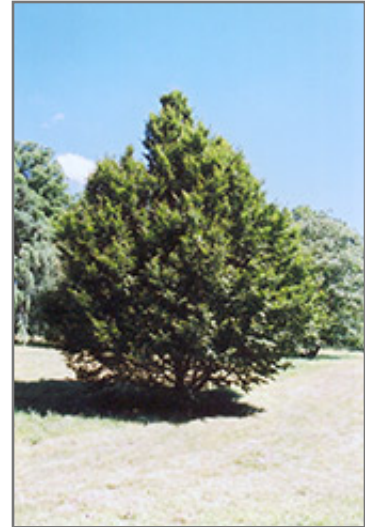
American Hornbeam

The American Hornbeam is recommended for the following landscape applications;