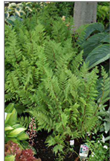
Lady in Red Fern