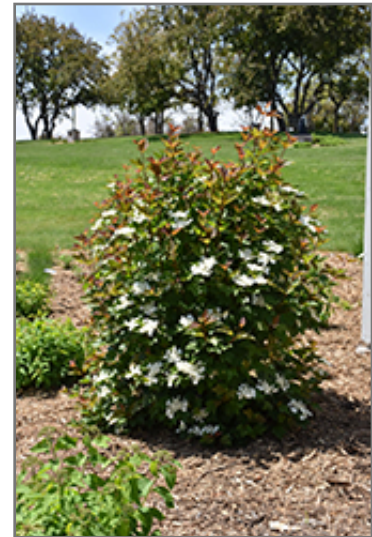
Redwing Highbush Cranberry in bloom