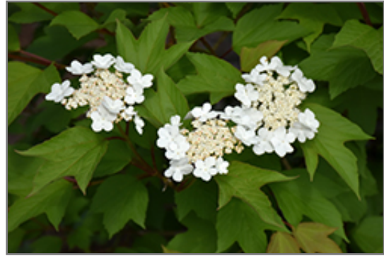
Redwing Highbush Cranberry flowers

Redwing Highbush Cranberry is a dense multi-stemmed deciduous shrub with an upright spreading habit of growth. Its average texture blends into the landscape, but can be balanced by one or two finer or coarser trees or shrubs for an effective composition.