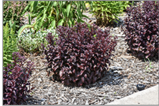
Dark Magic Stonecrop in bloom

Dark Magic Stonecrop will grow to be about 12 inches tall at maturity, with a spread of 20 inches. When grown in masses or used as a bedding plant, individual plants should be spaced approximately 16 inches apart. It grows at a fast rate, and under ideal conditions can be expected to live for approximately 15 years. As an herbaceous perennial, this plant will usually die back to the crown each winter, and will regrow from the base each spring. Be careful not to disturb the crown in late winter when it may not be readily seen!