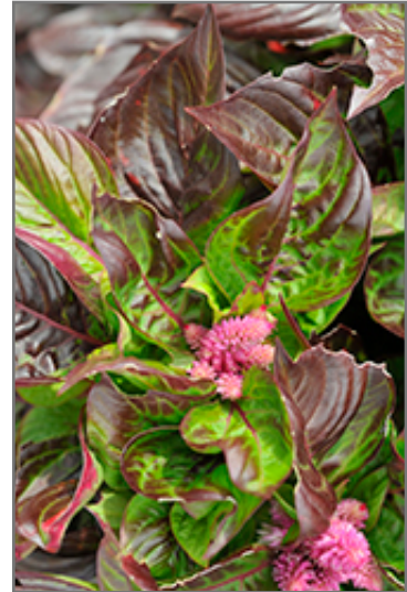
Sol Gekko Green Celosia flowers

Sol Gekko Green Celosia is recommended for the following landscape applications;