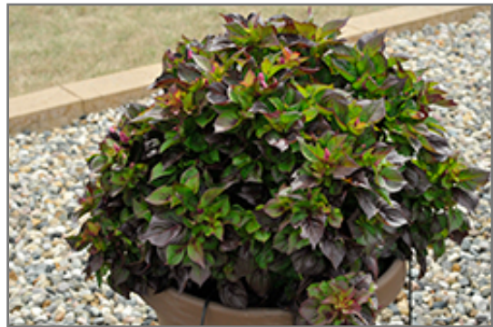
Sol Gekko Green Celosia