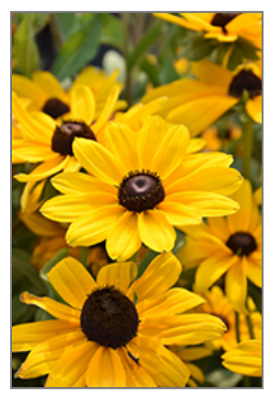
Indian Summer Coneflower flowers