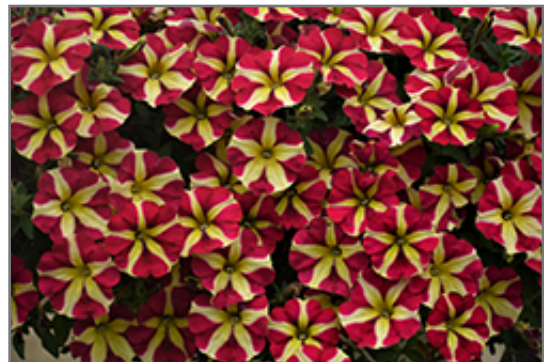
Amore Queen of Hearts Petunia flowers