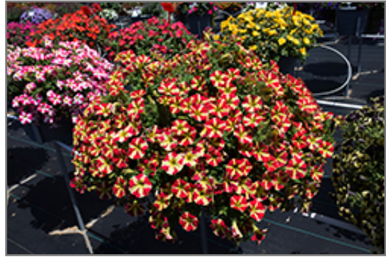
Amore Queen of Hearts Petunia in bloom

Amore Queen of Hearts Petunia will grow to be about 12 inches tall at maturity, with a spread of 14 inches. When grown in masses or used as a bedding plant, individual plants should be spaced approximately 10 inches apart. Its foliage tends to remain dense right to the ground, not requiring facer plants in front. This fast-growing annual will normally live for one full growing season, needing replacement the following year.