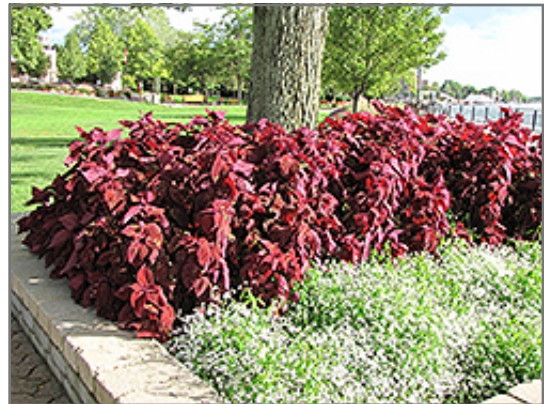
ColorBlaze Rediculous Coleus