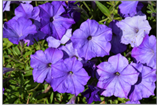
Easy Wave Lavender Sky Blue Petunia flowers

This plant will require occasional maintenance and upkeep. Trim off the flower heads after they fade and die to encourage more blooms late into the season. It is a good choice for attracting bees and hummingbirds to your yard, but is not particularly attractive to deer who tend to leave it alone in favor of tastier treats. It has no significant negative characteristics.