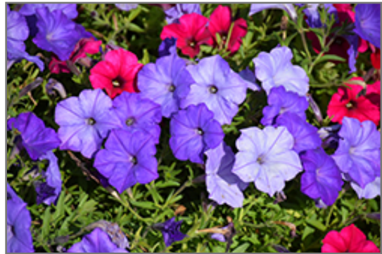
Easy Wave Lavender Sky Blue Petunia flowers