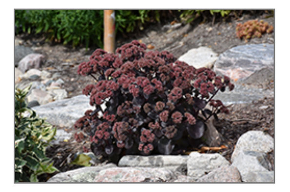
Night Embers Stonecrop in bloom

Night Embers Stonecrop is a dense herbaceous perennial with an upright spreading habit of growth. Its relatively coarse texture can be used to stand it apart from other garden plants with finer foliage.