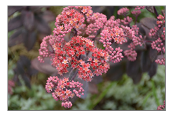
Night Embers Stonecrop flowers

2962 Jolly Lane Rapid City, SD 57703 605.393.1700 www.jollylane.com