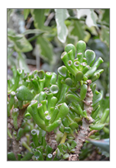
Hobbit Jade Plant foliage

This is a relatively low maintenance shrub, and can be pruned at anytime. It is a good choice for attracting bees and butterflies to your yard, but is not particularly attractive to deer who tend to leave it alone in favor of tastier treats. It has no significant negative characteristics.