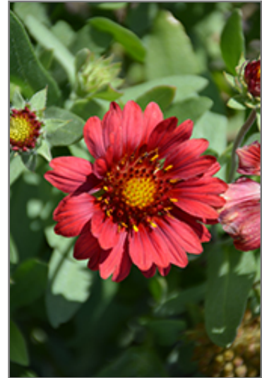
Mesa Red Blanket Flower flowers

Mesa Red Blanket Flower is recommended for the following landscape applications;