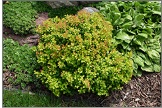
Limoncello Barberry

Limoncello Barberry is recommended for the following landscape applications;