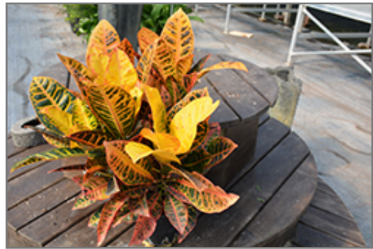
Variegated Croton