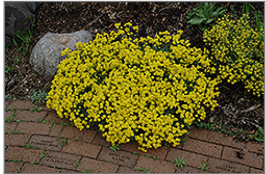
Gold Dust Basket Of Gold in bloom