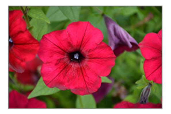
Tidal Wave Red Velour Petunia flowers

2962 Jolly Lane Rapid City, SD 57703 605.393.1700 www.jollylane.com