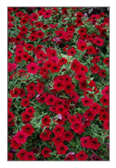
Tidal Wave Red Velour Petunia flowers