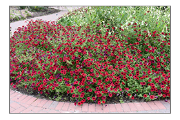
Tidal Wave Red Velour Petunia in bloom

This plant should only be grown in full sunlight. It does best in average to evenly moist conditions, but will not tolerate standing water. It is not particular as to soil type or pH. It is highly tolerant of urban pollution and will even thrive in inner city environments. This particular variety is an interspecific hybrid. It can be propagated by cuttings; however, as a cultivated variety, be aware that it may be subject to certain restrictions or prohibitions on propagation.