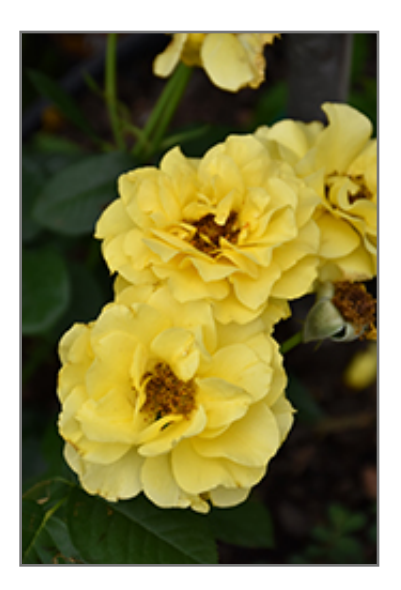
Sparkle And Shine Rose flowers

This shrub should only be grown in full sunlight. It does best in average to evenly moist conditions, but will not tolerate standing water. It is not particular as to soil type or pH. It is highly tolerant of urban pollution and will even thrive in inner city environments. This particular variety is an interspecific hybrid.