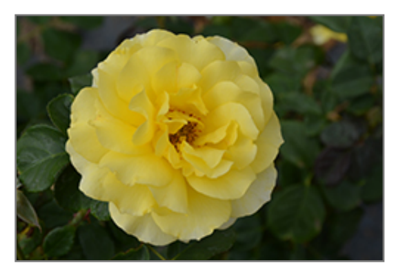
Sparkle And Shine Rose flowers

This shrub will require occasional maintenance and upkeep, and is best pruned in late winter once the threat of extreme cold has passed. It is a good choice for attracting bees to your yard. Gardeners should be aware of the following characteristic(s) that may warrant special consideration;