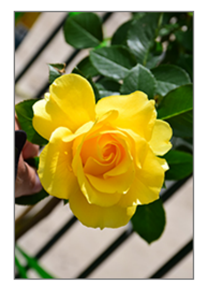
Sparkle And Shine Rose flowers