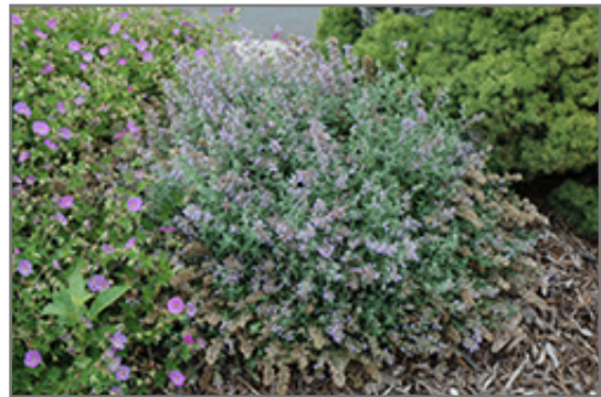
Cat's Meow Catmint in bloom