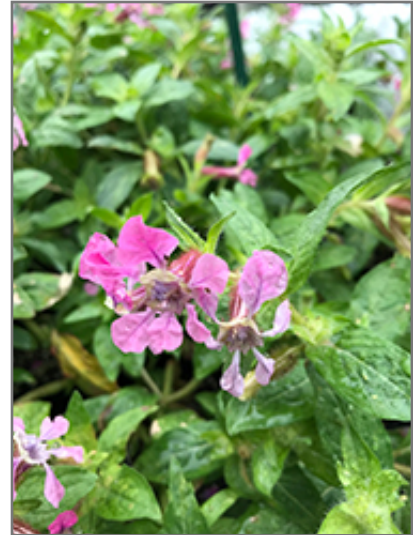
Sriracha Pink Cuphea flowers