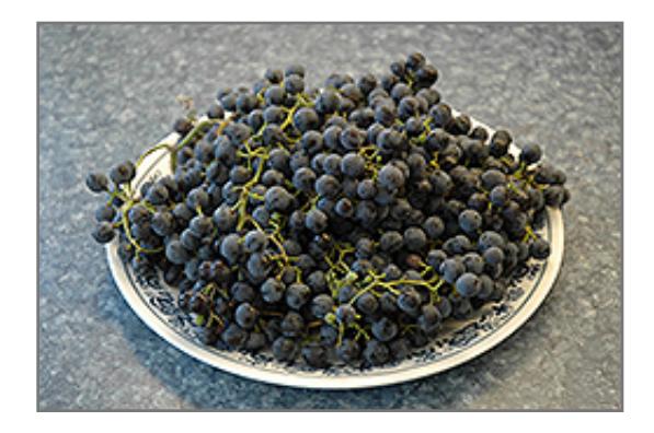
Frontenac Grape fruit

This is a dense multi-stemmed deciduous woody vine with a spreading, ground-hugging habit of growth. Its relatively coarse texture can be used to stand it apart from other landscape plants with finer foliage. This is a high maintenance plant that will require regular care and upkeep, and requires a special pruning regimen to reliably produce fruit; consult a specific reference guide or contact the store for proper pruning techniques. It is a good choice for attracting birds to your yard. Gardeners should be aware of the following characteristic(s) that may warrant special consideration;