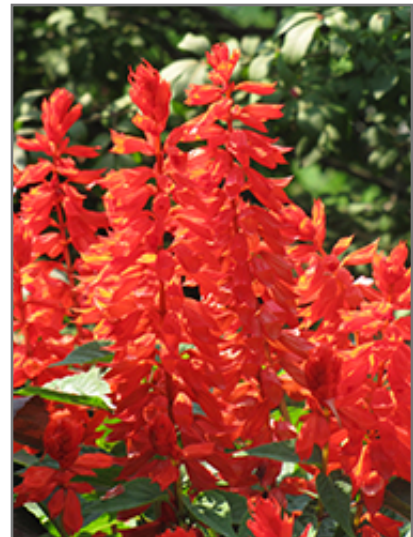
Lighthouse Red Sage flowers