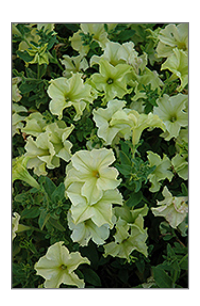
Sophistica Lime Green Petunia flowers

Sophistica Lime Green Petunia will grow to be about 15 inches tall at maturity, with a spread of 14 inches. When grown in masses or used as a bedding plant, individual plants should be spaced approximately 12 inches apart. Its foliage tends to remain dense right to the ground, not requiring facer plants in front. This fast-growing annual will normally live for one full growing season, needing replacement the following year.